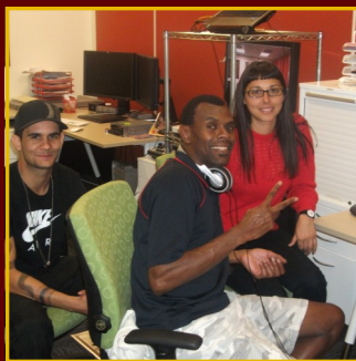
Below: Corroborree Day