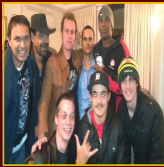
Above: Some of the boys