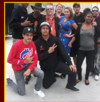
Behind the camera