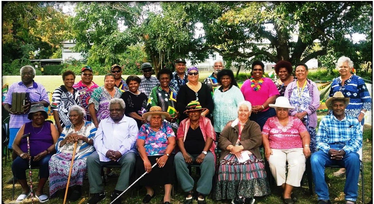
Elders present at the Market Blo Komuniti Event 2016.

To view more pictures from the Market Blo Komuniti event please visit RASSIC's facebook page: https://www.facebook.com/rassicinc/